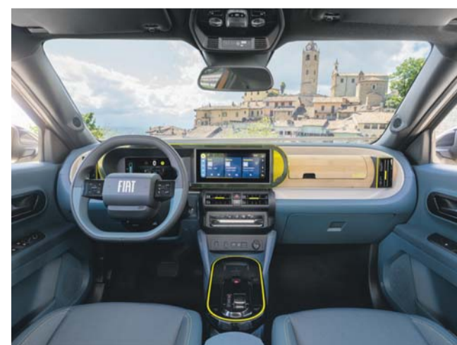
Fiat Grande Panda