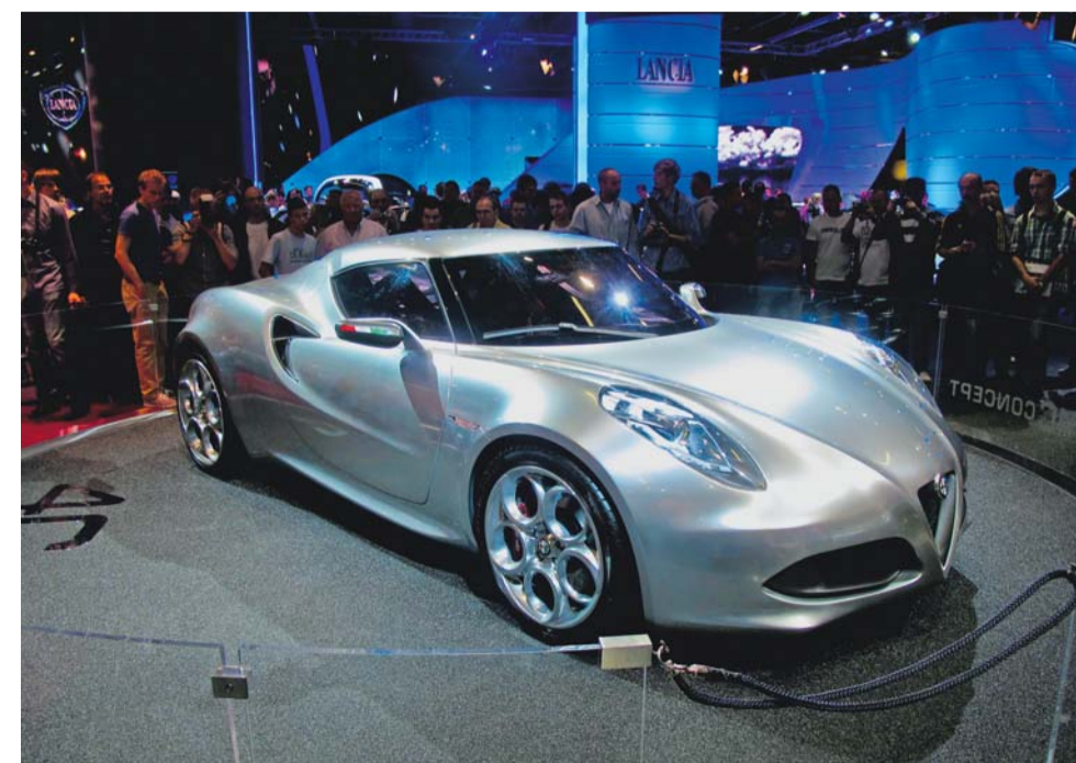
Alfa Romeo IAA Frankfurt 2011

"The Alfa Romeo 4C is the most fascinating object on four wheels ever created. And yes, I may be, quite possibly, alone in that assertion. But no matter. I love it"